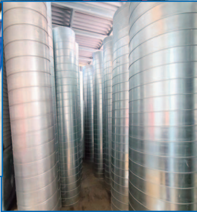
PARTIAL VIEW OF SUPPORT EQUIPMENT & INVENTORY